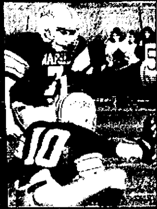
Wapsie wins big; on to the UNI-Dome for finals