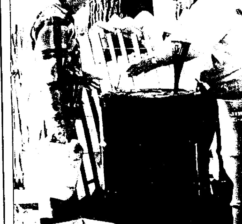
Roll out the barrels

Akihito became emperor immediately after the death of Hirohito in January 1989, but his enthronement was delayed until after a period of mourning.